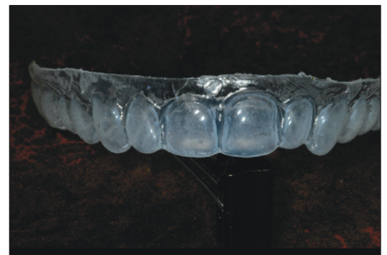
Figure 4. Reservoir tray showing gingival extension. Trays like these hold the bleaching gel intimately against the entire buccal surface of the teeth, but because the margin of the tray is extended on to the gingiva, there is no leakage at the gingival margin.

increase it if you need a little extra time or some extra materials. Then you can promise to "stick with it" even if this patient is a resistant case, and you are a hero if it takes less time to get the desired results.