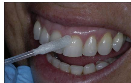
Figure 7. Applying a prewhitener with a soaked swab (Power Swabs [Power Swabs Corporation]).