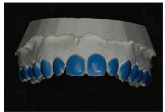
Figure 2. Block out added.