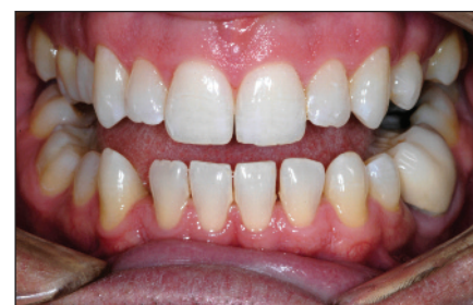
Figure 9. After whitening.

well with power bleaching. Whether or not you use a light source, power bleaching involves a dental professional applying a stronger whitening agent for a shorter period of time than when using trays. To shorten the time even more while improving the results, just swirl the soaked Power Swab all over the surfaces to