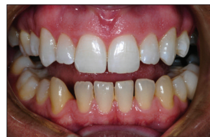
Figure 5. Midbleaching documentation photo. Upper teeth have been completed; the lower teeth are yet to be done.

The good news is that the prewhitener also works extremely