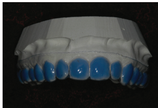
Figure 3. Tray on model.